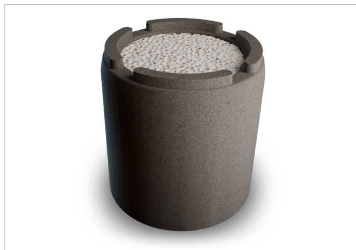
Clean Pour, top view

Clean Pour is our innovative first direct pour design, setting a new standard in casting precision and performance. This feeder application harnesses the power of Chemex's advanced cold box bonded insulating sleeve technology to deliver unmatched dimensional accuracy and repeatable castings results that set a new benchmark in the foundry industry.